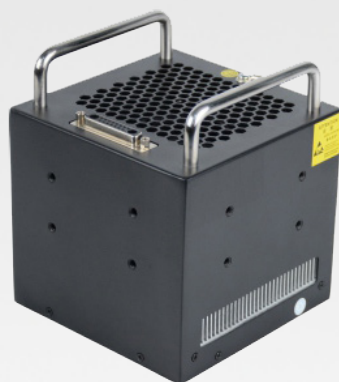
UV LED Head